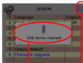
USB 2.0 detected by MDX 600